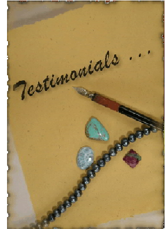
Share your testimony!